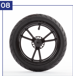
11 Pneumatic tires with 6-spoke rims