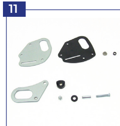
14 Tie down kit