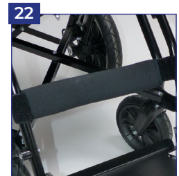
25 Calf strap with upholstery