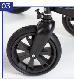
03 Plastic front forks