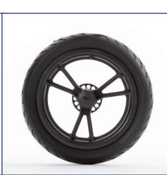
07 Polyurethan tires with 6-spoke rims