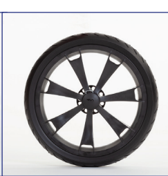
09 Polyurethan wheels with 7-spoke rims