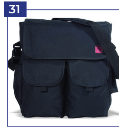
31 Accessory and diaper bag