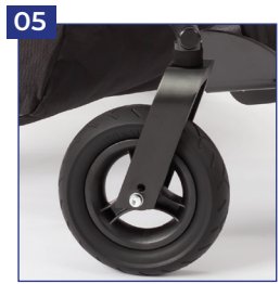
05 Aluminum front forks