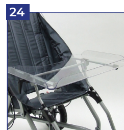
27 Therapy tray, transparent