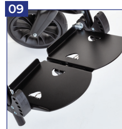
12 Foot board assembly