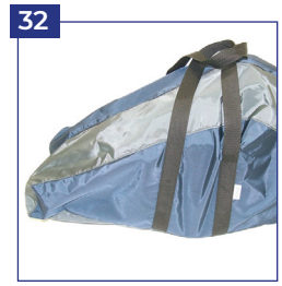
32 Nylon bag for transport