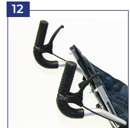
15 Attendant brake, two hand use