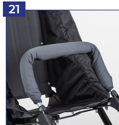
24 Grap rail with upholstery