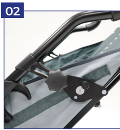
02 Recline angle extension 120°