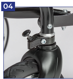
04 Swivel lock