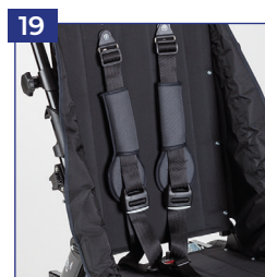
22 Five-point harness