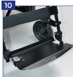
13 Foot board assembly straight