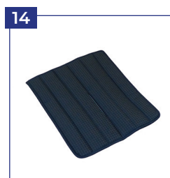
17 Seat upholstery