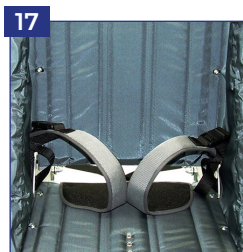
20 Groin strap