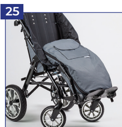
28 Winter warmer