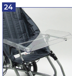
27 Therapy tray, transparent