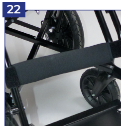
25 Calf strap with upholstery