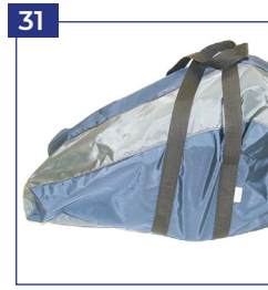
31 Nylon bag for transport