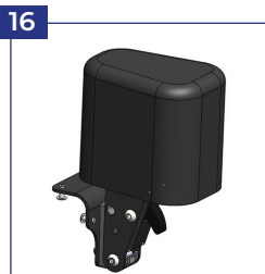
19 Abduction block