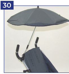
30 Sun shade