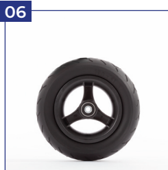
06 Polyurethan tires with 6-spoke rims