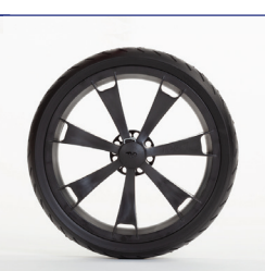
09 Polyurethan wheels with 7-spoke rims