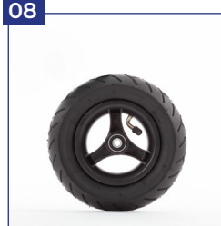
10 Pneumatic tires with 6-spoke rims