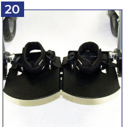
23 Ankle huger