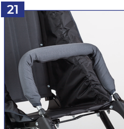
24 Grap rail with upholstery