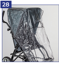
28 Canopy incl. transparent rain cover