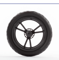
07 Polyurethan tires with 6-spoke rims