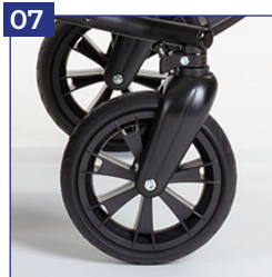
08 Polyurethan wheels with 7-spoke rims