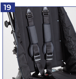
22 Five-point harness