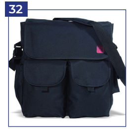
32 Accessory and diaper bag