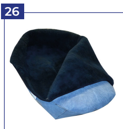
29 Sheep skin