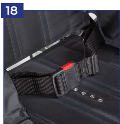
21 Lap belt