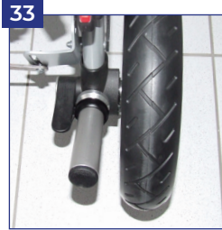
33 Tip assist