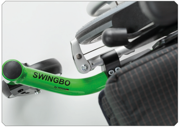
Wheel lock integrated in side panel.