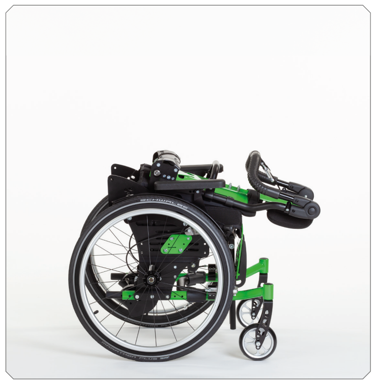
Extreme compact folding size.

Extreme compact folding size. Absolute lightweight.