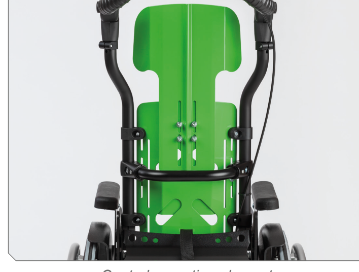
Central operating elements.