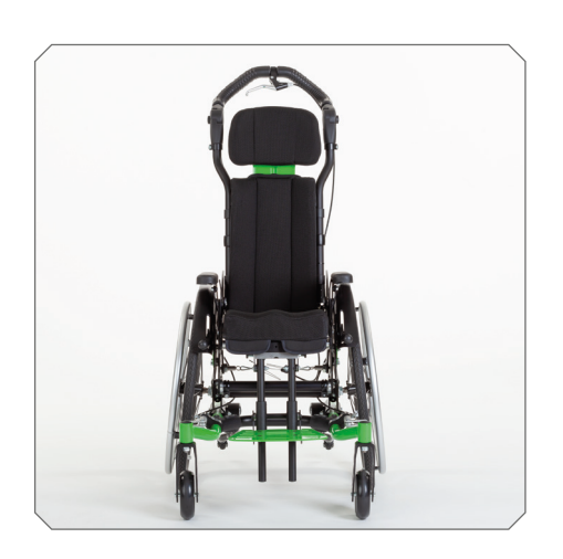
Exclusive and harmonious look. Light and very compact for transport.