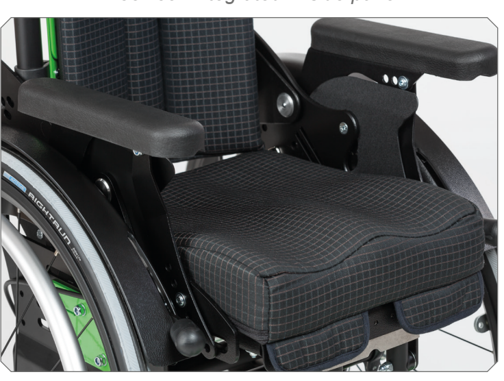
Armrests with tilt balancing function. Contoured seat cushion.