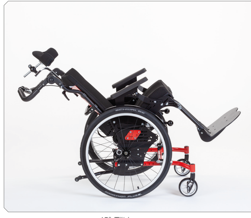
45° Tilt in space.

Modern, compact and sporty design. Modular and variable construction system.