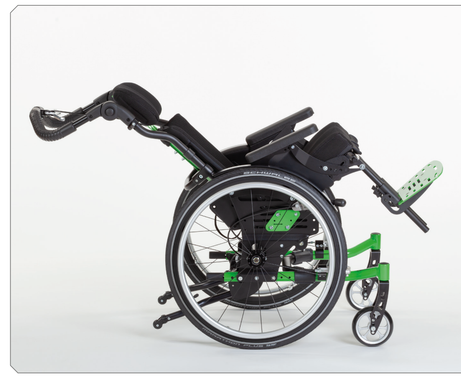
45° tilt in space.

Modern and sporty design. Modular and variable construction system.