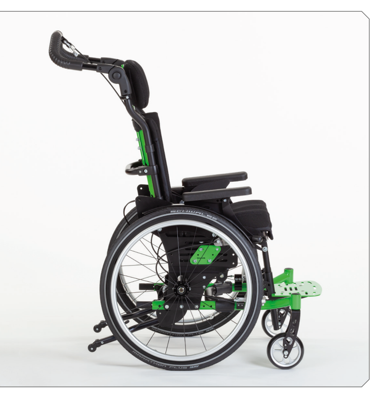
Variable and large growth capacity.