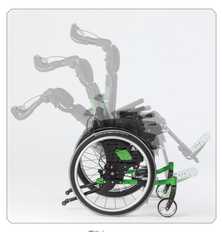
Tilt in space.