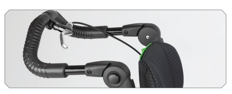
Release for tilt in space.