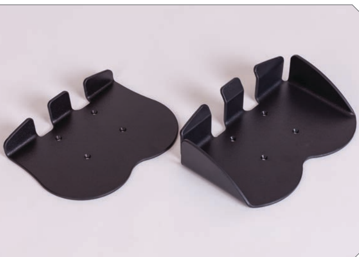
Variations of foot plate.