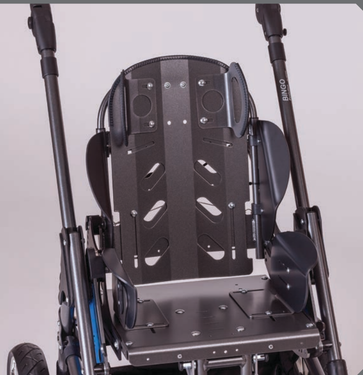
Multiple adjustment possibilities.

The multifunctional seat unit offers individual adjustment possibilities for your child thanks to a wide range of supports.