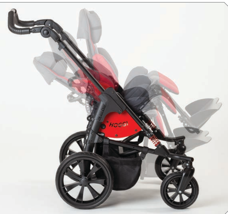
Tilt in space.

High seat comfort thanks to tilt in space and recline.