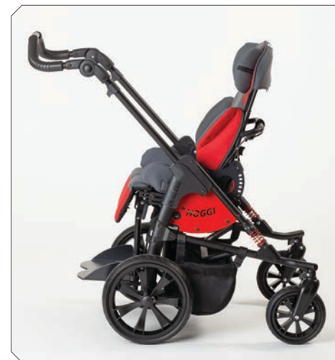
Seat unit against driving direction.