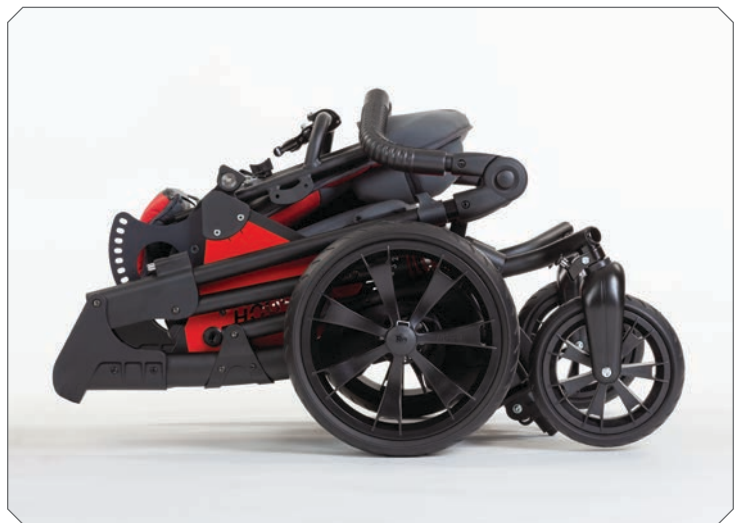
Compact folding size.