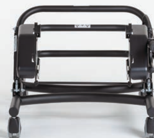
COBRA, lowest position.