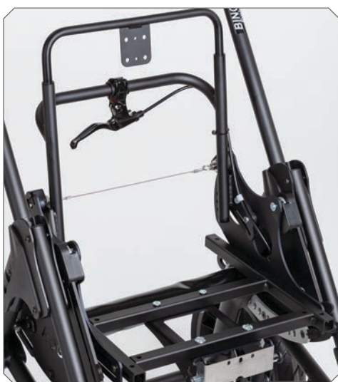
Seat frame & back base.