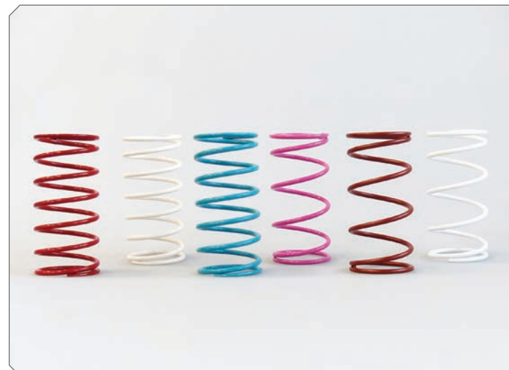
Spring sets in different intensities.