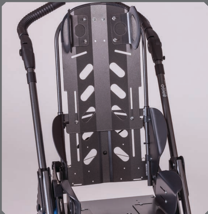
Huge growth capacity.