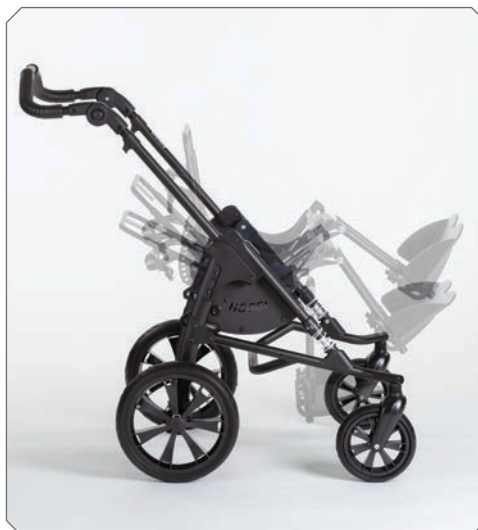
Adjustment range tilt in space.