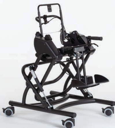
With seat frame & back base.