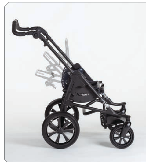
Adjustment range recline.