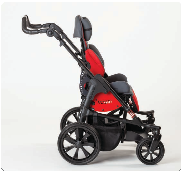
HOGGI laser cut side covers.