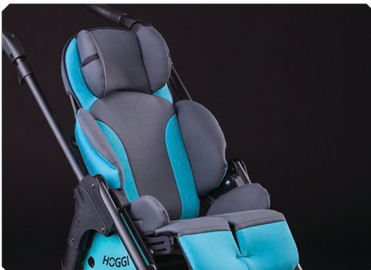
Frame suspension system.