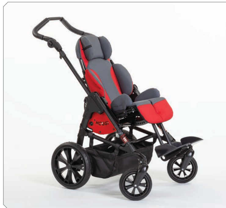
Compact. Light. Sporty.