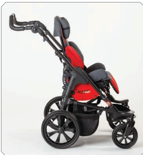
Seat unit in driving direction.