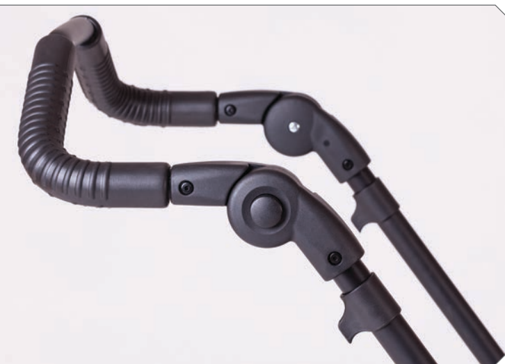
Height adjustable push bar.